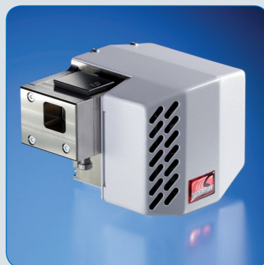
LYNXEYE 1-D detector