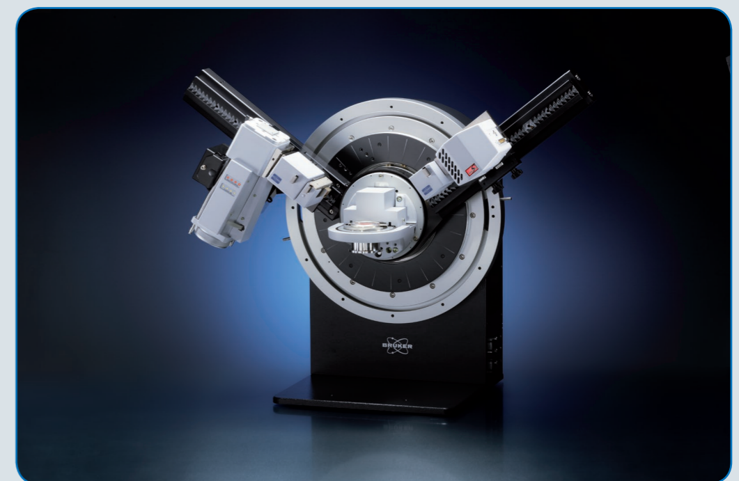
Bragg-Brentano geometry with LYNXEYE detector